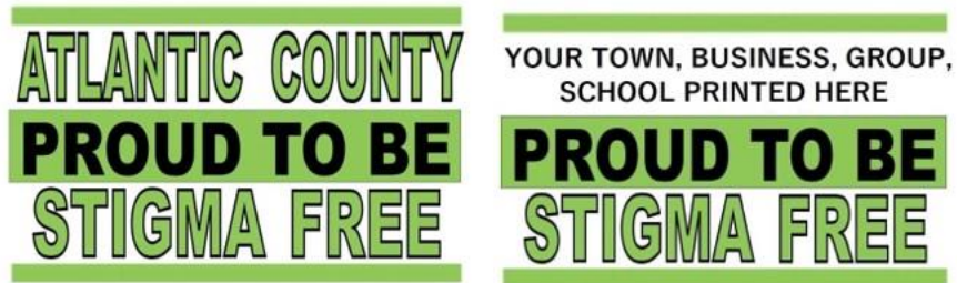
Sample Lawns Signs/Posters

The following images are examples of promotional materials that your collaborative may want to order from your local printer. The Stigma Free Atlantic Collaborative may have a limited number of materials. For more information contact: StigmaFreeAtlantic@mhanj.org